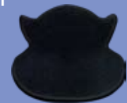
PRO POSTERIOR POLYMER PANEL