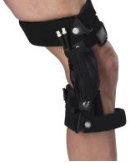
L1845 SWEDEO OA OFF LOADS WITH AIR, WON'T MIGRATE AND REHABILITATES THE QUADS! Off The shelf