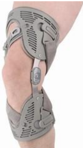
UNLOADER ONE OTC (over the counter) L1845 code