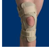
L1832 THERMOSKIN KNEE Increases CIRCULATION RA, Ligaments, Injury, Won't Migrate