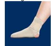
L1902 AFG STABILIZER

"Best of Both Worlds" Combines the support of a rigid brace with the comfort of a lace up brace. Patented built in stabilizer actually molds to the shape of your ankle from body heat. HIGH ACTIVITY