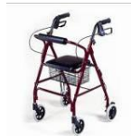
E0143 & E0156 Wheeled Walker with Seat, adjustable handle bar height, nice seat and carry basket