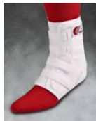
L1902 Easy Lok NEW!

The Arch Lok is a hinged style brace with a modified orthotic footplate. The footplate provides critical foot and arch support to help rehabilitate a recently injured ankle. Ideal for poor arches or Flat Feet