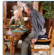
E0628 Electric Lift Seat for those who cannot stand up on their own, but can walk after standing.