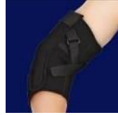
L3760 THERMOSKIN ELBOW Hinged ROM, Increases Circulation