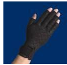
L3908 THERMOSKIN CT Glove Covers fingers and Wrists. Removable Brace.