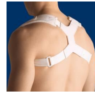
L3650 Clavicle Support Broken, Fractured, or deformity in Collar bone? Provides support and conditioning for the clavicle.