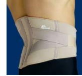
L0631 THERMOSKIN APD RIGID LUMBAR SUPPORT, Critical Support to back and abdomen, the ONLY brace worn against skin and increases circulation!