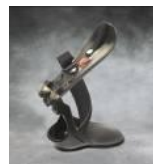
L1971, L2210 Step Smart Solution for Drop Foot!

L4360 Aeris Walking Boot Dual air chambers positioned medial / lateral at the ankle can be inflated and deflated for ideal compression and a custom fit. Designed for the treatment of stable fractures, ankle sprains, or fascia.