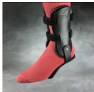
L1906 Arch Lok

Rigid Brace , strongest active wear support, worn inside shoe. Hinged Style Brace. Weak Ankles, Foot and Arch Support, Poor Arches, Flat Feet. Rehabilitates recently injured ankles. ALL ACTIVITY