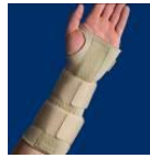
L3908 THERMOSKIN Wrist Forearm Splint Covers Forearm