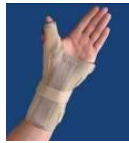
L3807 THERMOSKIN Carpal Tunnel with Thumb Spica, protects Thumb