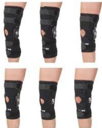
STANDARD ROM (range of motion) Short Wrap (bottom row only) L1832 code