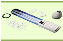
ED Pump L7900